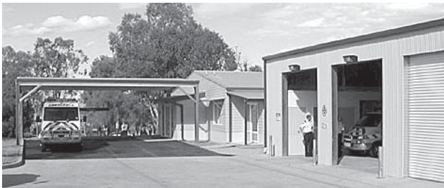
The new Boggabri Ambulance Station collocated in the grounds of Boggabri Hospital.