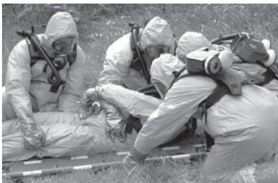
At a CBR training exercise in the Hunter area, ambulance officers and health personnel performed practical tasks in Personal Protective Equipment (PPE) Tyvek suits and SE400 respirators.