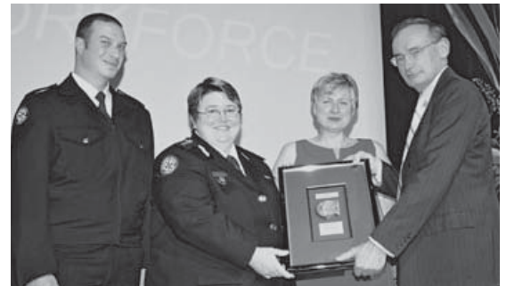
The Premier of NSW, Bob Carr, presented staff from the Service’s Employee Relations Unit with the Premier’s Gold Award for Workplace Diversity.