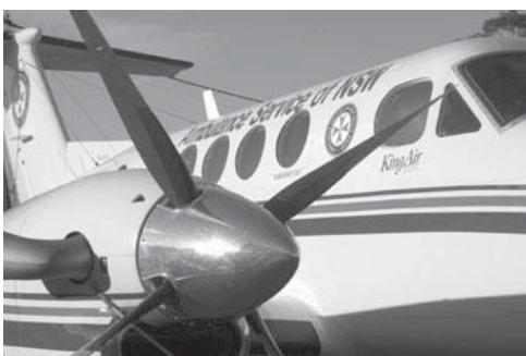
The delivery of the first of four new Super King Air aircraft will modernise the Air Ambulance fleet.