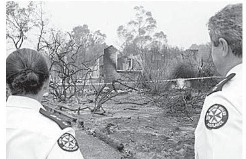
Over 500 homes were destroyed in and around Canberra in January 2003.