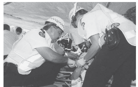
Ambulance officers treat one of the many casualties at the Waterfall train disaster.